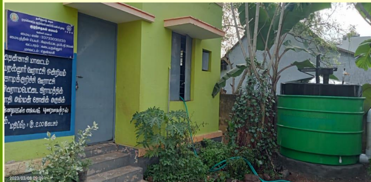
Plant installed at Anganwadi, Tenkasi