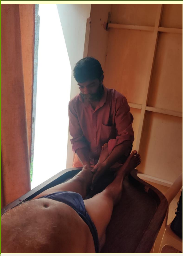
Massage treatment is on ......

Green health home worked for 14 days. 219 patients treated. In addition, 116 people underwent Varma massage