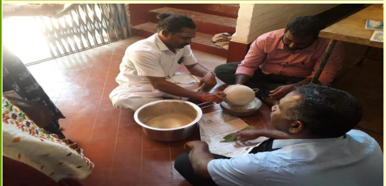
Medicine preparation is on ....