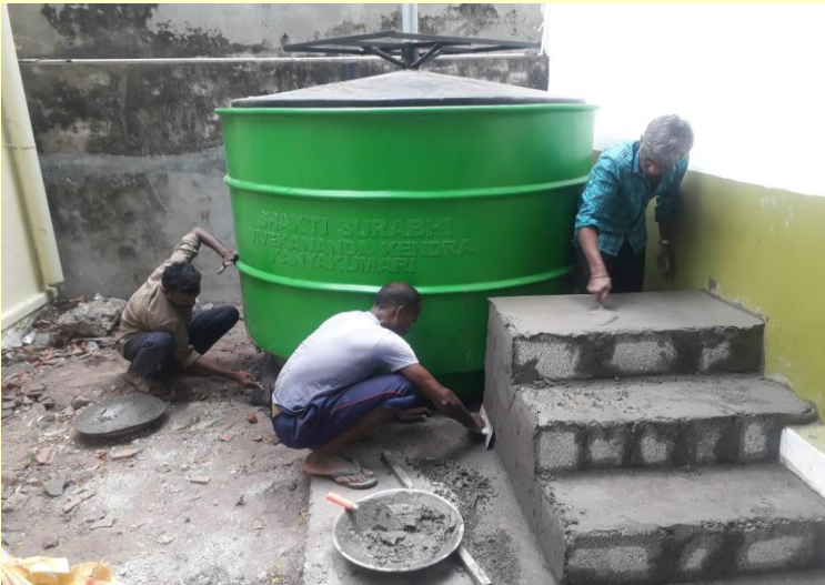
Construction of Steps is on.. for pouring the kitchen waste to the bio-methanation plant at Govt. High School, Eraviputhur

3 nos. of 6 cum and 1 no. of 2 cum Bio-methanation plants (Portable) commissioned in Govt. Schools, Kanyakumari district.