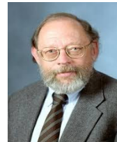
Donald Worster Author - ‘Deep Ecology for the 21st Century’