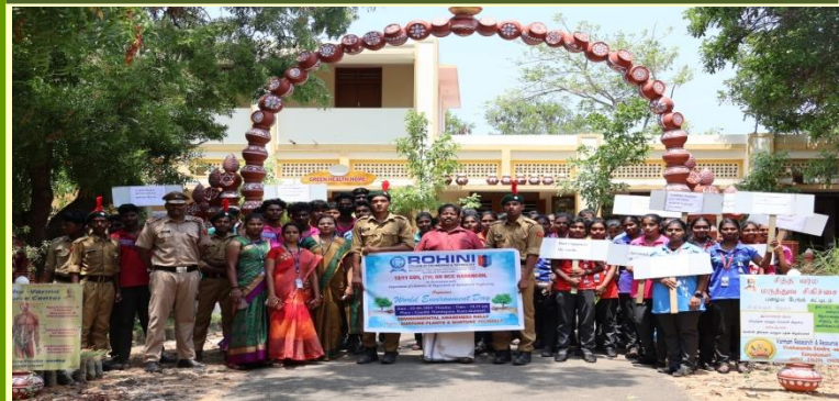
Participants posing for photograph