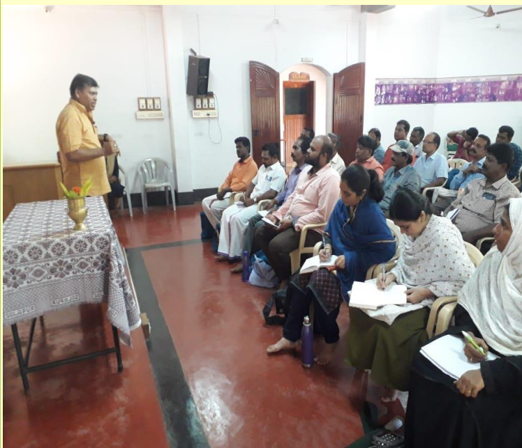
Dr.V.Ganapathy explaining the comparative Research and applicable study on selective varmam on lower extremities