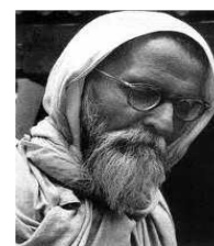
- Acharya Vinoba Bhave

Most parents are anxious for their boys to complete the school course so that they can get a salaried job and lead an easy life. This however is a wrong way of looking at education. Learning has value in its own right. The purpose of learning is freedom—and freedom is another word for what we have called Self-reliance.