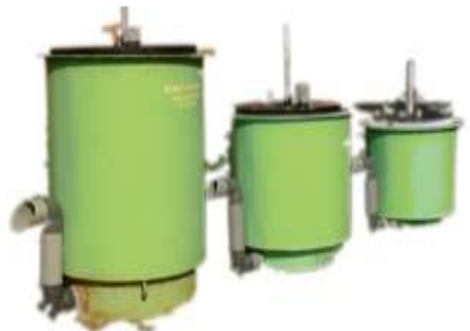
Shakti Surabhi portable Bio-methanation plants Range – 0.25 cum to 6 cum