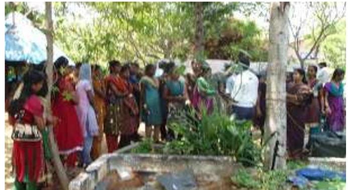
Anna college students studying various composing technologies at VK-nardep garden.