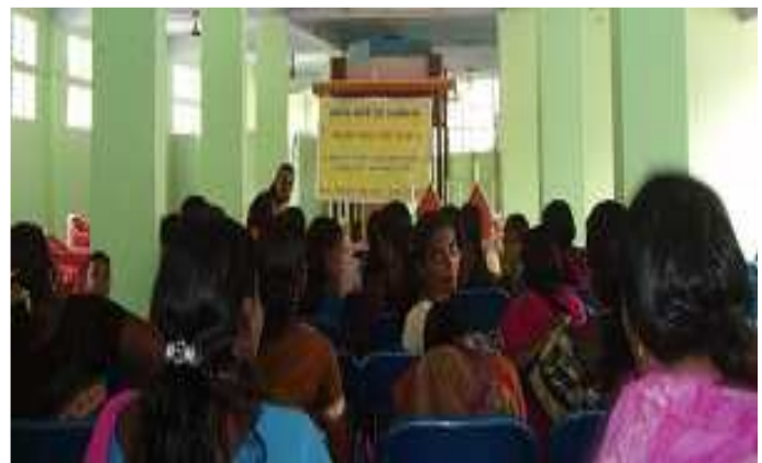
Kulachel: Women assembled to learn about vermi-composting technology.