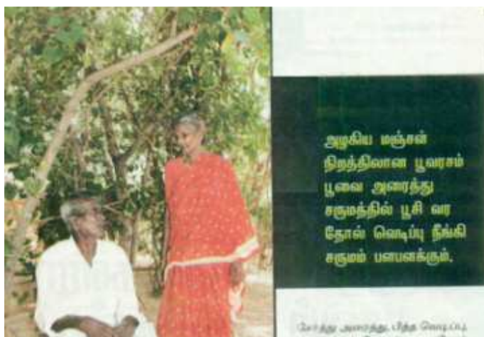
An excerpt from the article by Dr.Ganapathi reveals how the flowers of the tree can be used for healthy living.