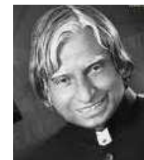
Dr. APJ Abdul Kalam

At the end of the class, our teacher wanted to know whether we understood how the birds fly. I said, I did not understand how the birds fly. When I said this ...our teacher did not get upset by our response. That evening the whole class was in the sea shore. We enjoyed the roaring sea waves knocking at the rocks in the pleasant evening. Birds were flying with sweet chirping voice. He showed the sea birds in formation in 10 to 20 numbers, we have seen the marvelous formation of birds with a purpose and we were all amazed. ... He showed the birds and asked us to see when the birds fly, what it looked like. We saw the wings being flapped. He asked us to look at the tail portion with the combination of flapping wing and twisting tail. We noticed closely ... Then he asked us a question, where the engine is and how it is powered. Bird is powered by its own life and the motivation what it wants. All these things were explained to us within 15 minutes. We all understood the whole bird dynamics with practical example. How nice it was? Our teacher was a great teacher; he could give as a theoretical lesson coupled with live practical example. This is real teaching.