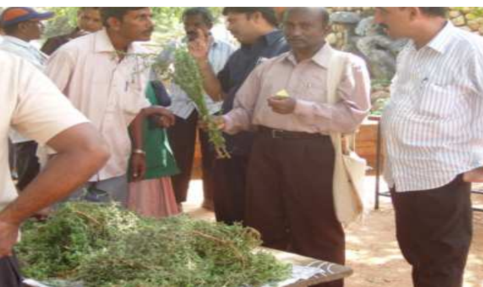
Physicians exhibiting various herbal components used in complementary Varma medical treatment.

This is an unique system of medicine which involves treatment of vital nodes all over the body for various ailments. In Kanyakumari district there is a flourishing local medical system of Varma medicine for bone-setting. There is also a complementary system of herbal oils and treatment along with Varma massage.