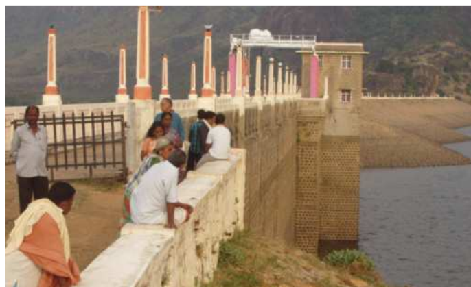
VK-nardep family: enjoying the tour-refreshing session at the Manimuthar Dam.