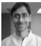
-Makarand Paranjape Author

The first step is to bridge the gulf, end the dualism. That can only be done when some technologists will go and actually live in the villages. In a certain vision of what India should be, every village will have one or two technologists. Every village will have an advanced communication centre, one or two good doctors--and you don't need very high technology for this. Every village will be able to shape its own destiny and future, and have the right kind of technology, and people will spend time trying to figure out what that village needs as opposed to what a Tata or Birla needs in the city. This, to say the least, will be the Dharma of Technology. And with more and more serious thought on this vital issue, perhaps a new kind of science, a new way, at any rate, of doing science may be born in this land.