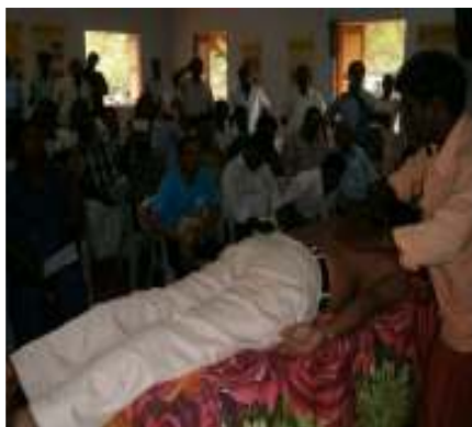
Ethno Medical Science Workshop: Demonstration