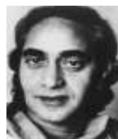
Swami Rama Mystic Yogi

The Himalayan sages taught me first the gospel of nature. Then I started listening to the music coming from the blooming flowers, from the songs of the birds and even from the smallest blade of grass and thorn of the bush. In everything lives the evidence of the beautiful. If one does not learn to listen to the music of nature and appreciate her beauty, then that which impels man to seek love at its fountain may be lost in the remotest antiquity. Do you need psychological analysis to discover in nature the source of so much happiness, of so many songs, dreams and beauties? This gospel of nature speaks its parables from the glacial streams, the valleys laden with lilies, the forests covered with flowers and the light of stars. This gospel reveals that emphatic knowledge through which one learns truth and beholds the good in all its majesty and glory. When one learns to hear the music of nature and appreciate her beauty, then his soul moves in harmony with its entire environment. His every movement and every sound will surely then find its due place in human society. The mind of man should be trained to love nature before he looks through the corridor of his life. Then a revelation comes peeping through with the dawn. The pain and miseries of life disappear with the darkness and the mist when the sun rises.