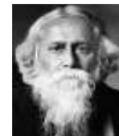
Rabindranath Tagore Poet

We can imagine that if there is any root similarity between the inanimate world and the conscious world, it must be the all-pervading energy, or the heat in matter. After a considerable time science has discovered that when we look at matter, however, inert it may seem superficially and devoid of sparks, there is a kind of illuminating process that goes on unobtrusively within it. This illuminating spark in its subtle form manifests itself in life; moreover, it manifests itself further in yet a subtler form in consciousness and mind. As we find there is nothing but this great luminous spark in the beginning of creation, we have to own that this consciousness is its manifestation. By raising layers of coverings one by one from the inanimate to the animate, it is constantly aiming to unfold this greater consciousness in man by gradually removing all its shrouded veils. This evolved freedom of consciousness is perhaps the ultimate destiny of creation. ... The earth, water and light, fruits and flowers, to her (India), were not merely physical phenomena to be turned to use and then left aside, were necessary to her in the attainment of her ideal of perfection, as every note is necessary to the completeness of the symphony.