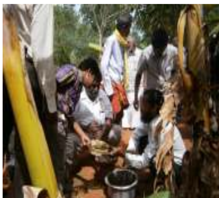
Ethno Medical Science Workshop: Studying Herbal formulations