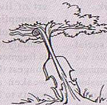
Music should continue

“The real challenge is to find a way of dismantling the consumer society and replacing it with a society rich in satisfactions and pleasures which make shopping and material acquisition pale by comparison. The switch depends on individual lifestyle changes and an increase in creative expression, as well as on a restoration of community bonds and determination to find ways of demonstrating a way of life which is attractive and exciting. As our values change, our ideas about appropriate consumption will change naturally and painlessly.