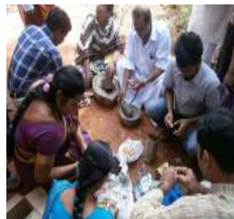
Ethno Medical Science Workshop: This workshop is about sharing the knowledge across each other and across generations. By creating a platform for sharing the knowledge we conserve it and create awareness about this precious non-tangible wealth.

Shakti Surabhi -1 cum: 5 plants Shakti Surabhi - 6 cum:1 plant Shakti Surabhi (fixed) – 2cum:1 plant