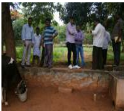
Azolla Workshop: participants Watching Azolla being fed to the cow

Training programme on “Azolla Cultivation Technology” was conducted at VK-nardep TRC, Kalluvilai on 22 nd of this month. 7 farmers participated. The resource person was Dr.P.Kamalasanan Pillai.