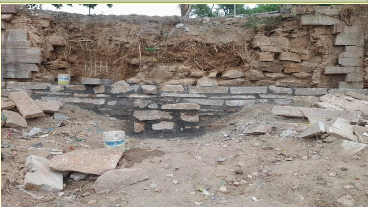
Collapse of the wall because of tree roots