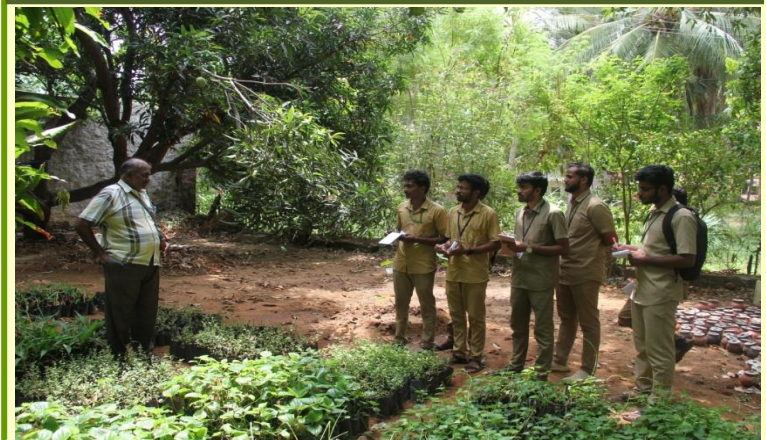
Students learnt how to make seedlings

8 students from VOC Agricultural College and Research Institute, Killikulam visited J.C.Bose Nursery on 16 th May. They learned Sustainable agricultural technologies.