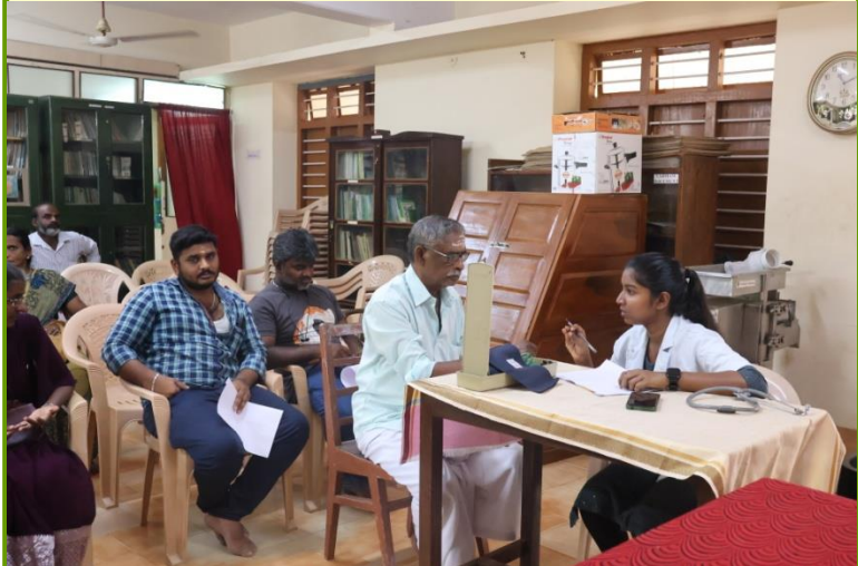
Consultation is on ...