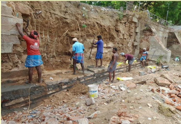
Tree roots have damaged the wall by penetrating inside

Revival and Renovation work of Surya Pushkarani at Aruppukottai, Virudhunagar district is in full swing. The project is sponsored by Lakshmi group of companies, Coimbatore.