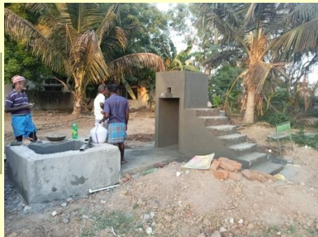
Provision of steps for climbing and pouring the material in the Hydrolysis tank