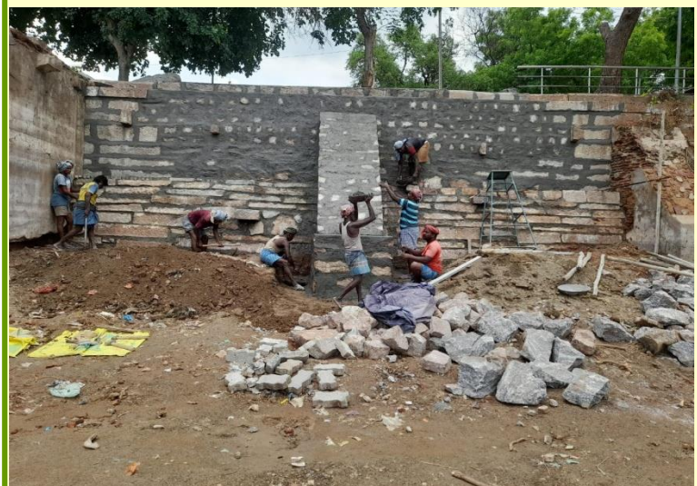
Workers are at work.. Background views of newly constructed piers for strengthening the walls