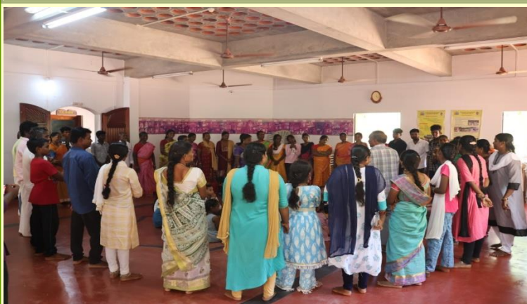
All the participants enjoying indoor games