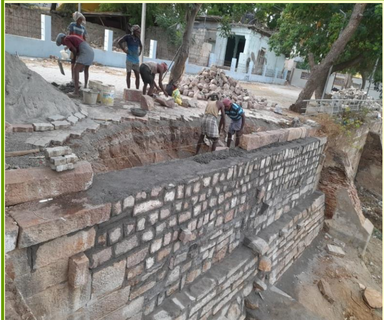
Reconstruction of the damaged wall