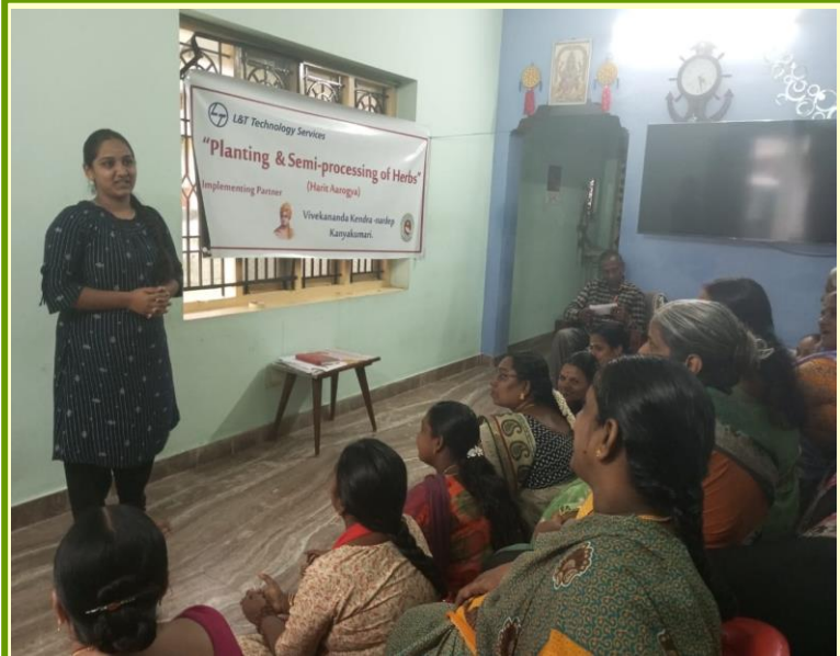
Camp participant sharing her experiences