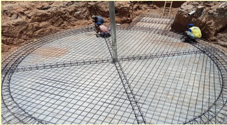
Foundation by RCC work - bigger size Bio-methanation plant

In the month of May, one 100 cum Bio-methanation plant commissioned at Villupuram.