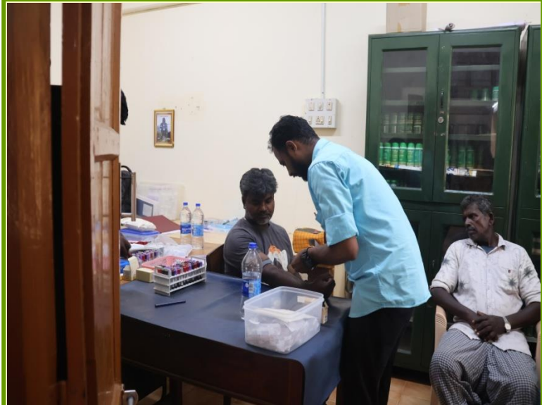
Taking blood for testing