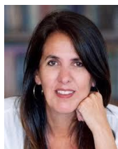
Martha Medeiros Brazilian poet