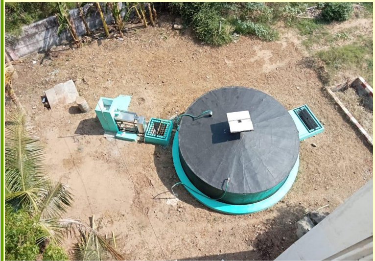
Beautiful Aerial view of the completed 100 cum Bio-methanation plant with hydrolysis tank, crusher, outlet tank and weight above the gas holder