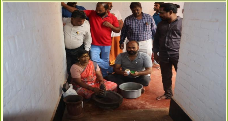
Medicine preparation is on ... during the workshop