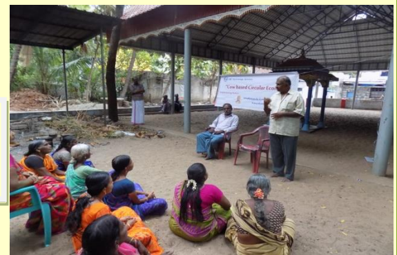
Awareness Programme at Kottavilai