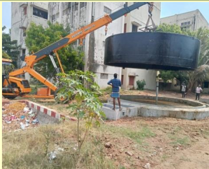
Placing of FRP Gas holder above the reactor with the help crane