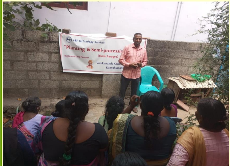
Stakeholders eagerly listening the scheme - Harit Aarogya