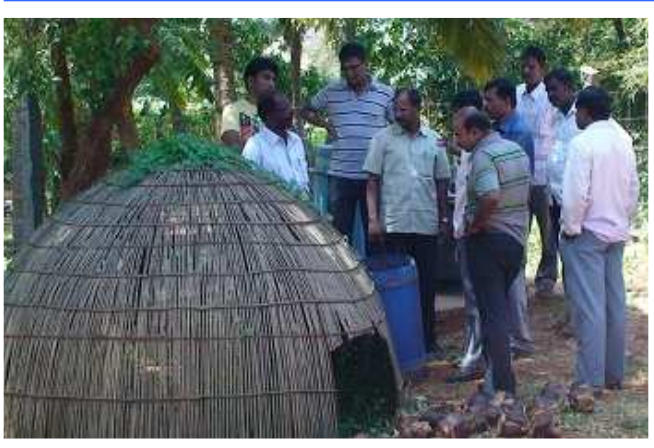
Participants of the workshop on bio-methanation plant also study and learn the technologies first hand at Technology Resource Center, Kalluvillai.