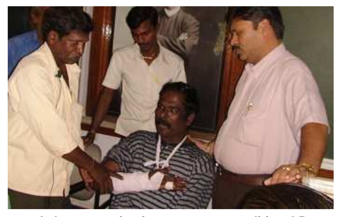
A demonstration in progress on traditional Bone Fracture Treatment in the workshop on these practices.

At Gramodaya Park Kanyakumari, there are live models which explain through simulation, how to harvest rain water