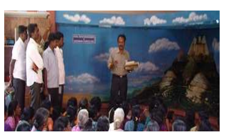
The live model on water harvesting is being explained at a session during study tour pogramme.

Workshop on "Kitchen Waste (Shakti Surabhi) Biogas Plant" was held at Technology Resource Center (TRC) Kalluvillai on 25<sup>th</sup> of this month. The resource Person was Shri.V.Ramakrishnan. 14 persons attended this programme.